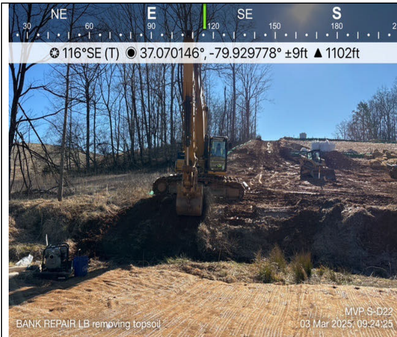
Photo Description: The topsoil was removed from the left bank and stockpiled.