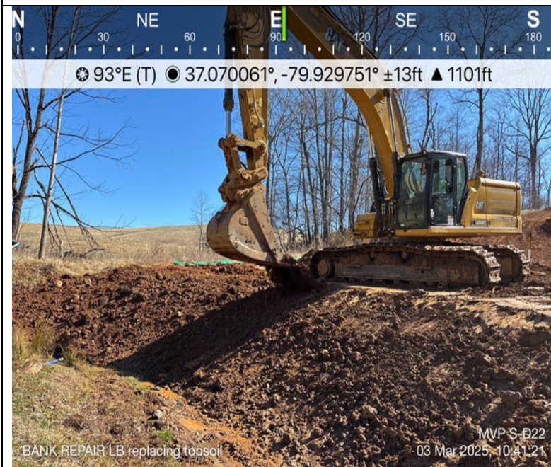
Photo Description: The topsoil was returned to the left bank and then seeded.

Photo Description: The bank was regraded to repair the slope.