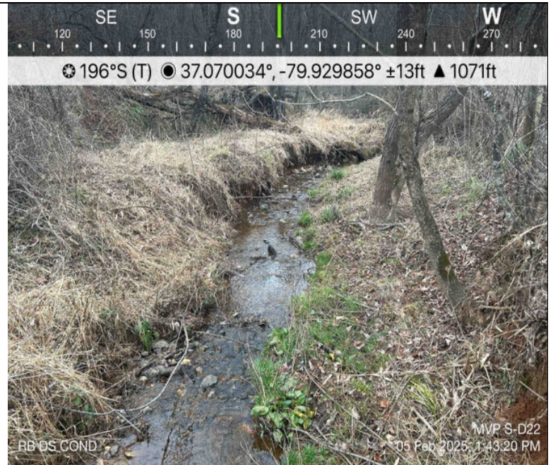
Photo Description: Conditions of the downstream area outside the ROW during pre-construction assessment.