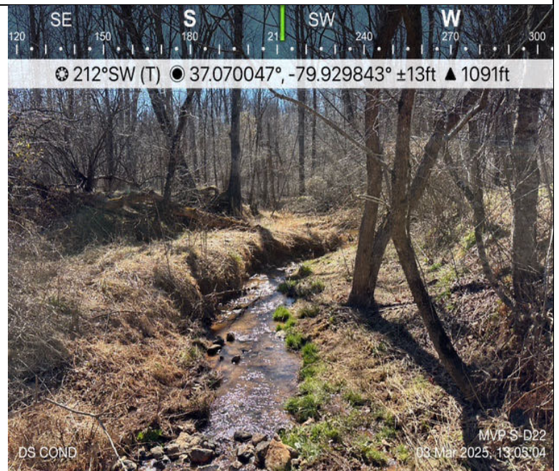
Photo Description: Conditions of the downstream area outside the ROW during post-construction assessment.