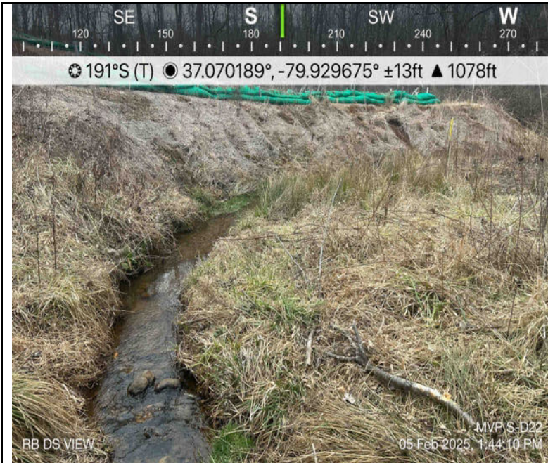
Photo Description: Downstream view of permitted impact area during pre-construction assessment.