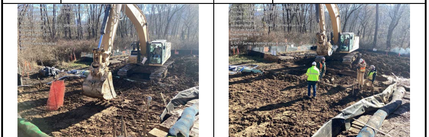
GPS Location See Photo GPS Location See Photo Description Photo 7: Backfilled complete and contouring ongoing. Description Photo 8: Survey shooting elevations.