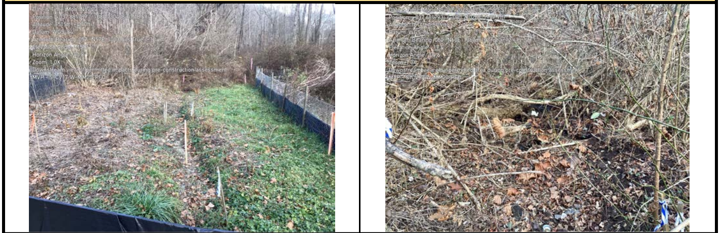
GPS Location See Photo GPS Location See Photo Description Downstream view of permitted impact area during pre-construction assessment. Description Downstream view of unimpacted area during pre-construction assessment.