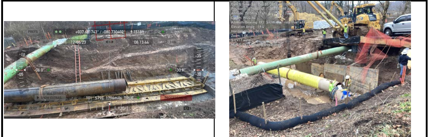
GPS Location See Photo GPS Location See Photo Description Photo 3: Bore track installed through aquatic resource. Description Photo 4: Pipe in trench through aquatic resource. Preparing to weld to road bore.