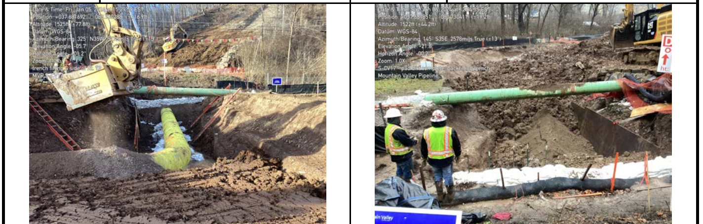
GPS Location See Photo GPS Location See Photo Description Photo 5: Northern trench breaker constructed and padding dirt added to trench. Description Photo 6: Padding dirt and subsoil added to trench in aquatic resource area.