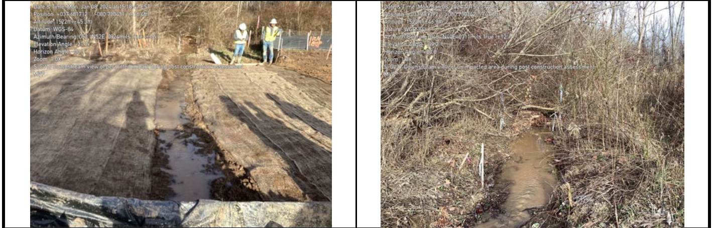
GPS Location See Photo GPS Location See Photo Description Downstream view of permitted impact area during post-construction assessment. Description Downstream view of unimpacted area during post-construction assessment.