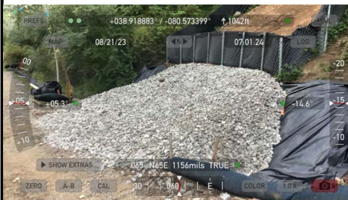
GPS Location See photograph. Description Flume was placed on 8/20/2023. The photo was taken at the beginning of the workday on 8/21/2023. Stream crossing will not start today.