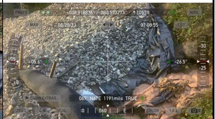
GPS Location See photograph. Description The photo was taken at the beginning of the workday on 8/28/2023. The stream crossing will not start today.