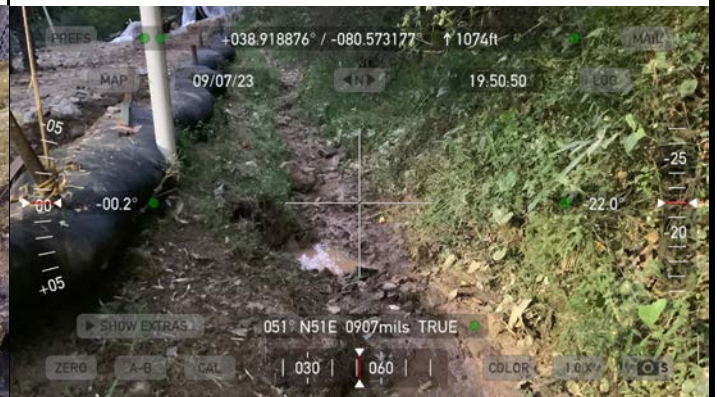
GPS Location See photograph. Description Downstream view of unimpacted area during post-construction assessment.