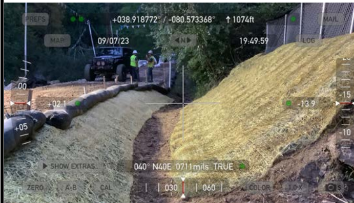
GPS Location See photograph. Description Downstream view of permitted impact area during post-construction assessment.