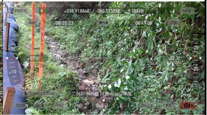
GPS Location See photograph. Description Downstream view of unimpacted area during pre-construction assessment.