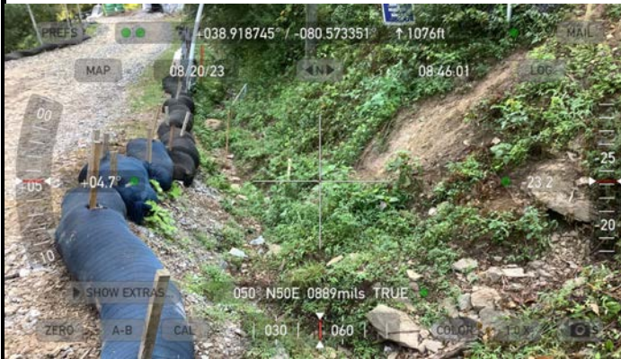
GPS Location See photograph. Description Downstream view of permitted impact area during pre-construction assessment.