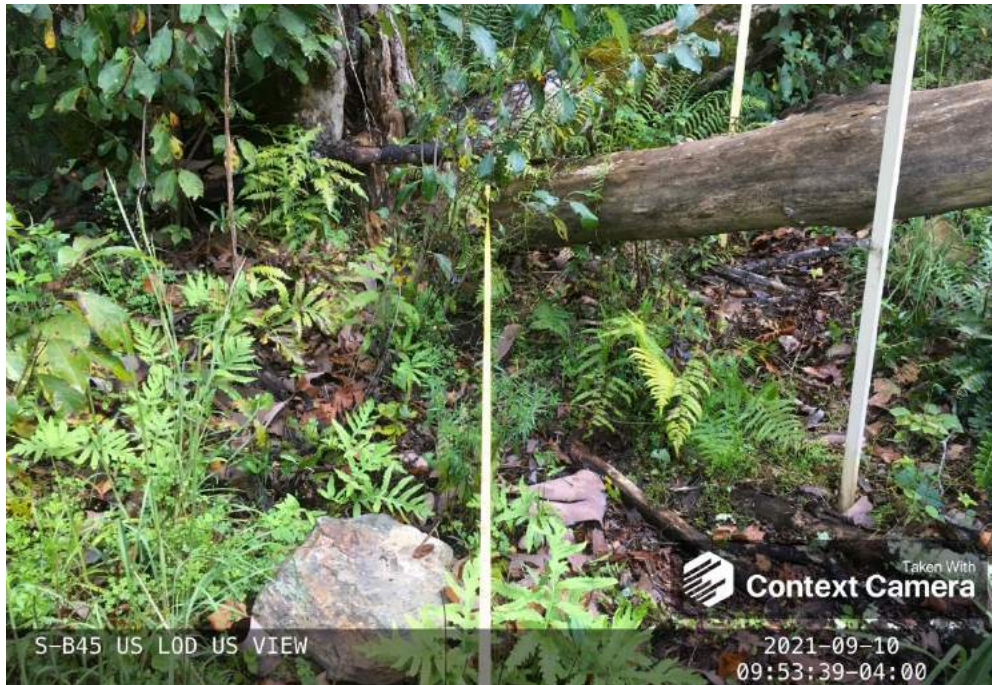
Photo Type: US, US View Location, Orientation, Photographer Initials: Upstream Edge of ROW, Upstream View, HC Lat: 38.493394 Long: -80.560786