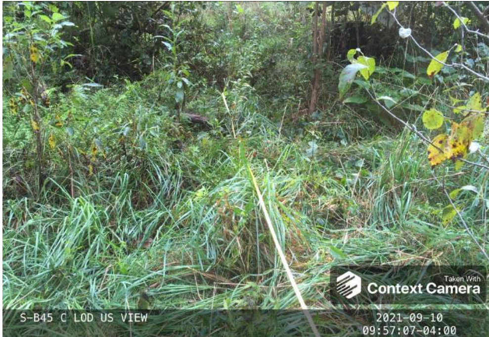
Photo Type: US View at Center Location, Orientation, Photographer Initials: Center ROW, Upstream View, HC Lat: 38.493394 Long: -80.560786