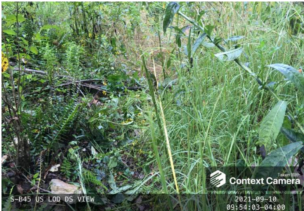
Photo Type: US, DS View Location, Orientation, Photographer Initials: Upstream Edge of ROW, Downstream View, HC Lat: 38.493394 Long: -80.560786