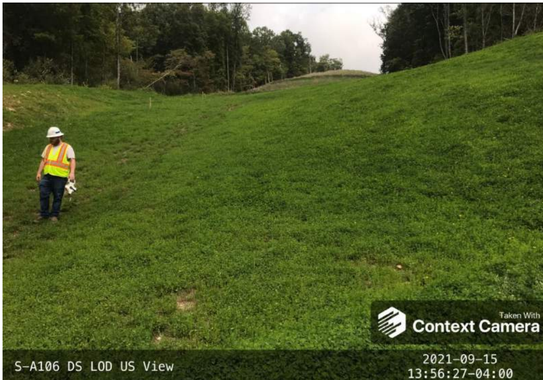
Photo Type: DS, US View Location, Orientation, Photographer Initials: Downstream Edge of ROW, Upstream View, Lat: 39.168435 Long: -80.577625