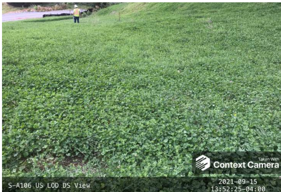
Photo Type: US, US View Location, Orientation, Photographer Initials: Downstream Edge of ROW, Upstream View, Lat: 39.168435 Long: -80.577625