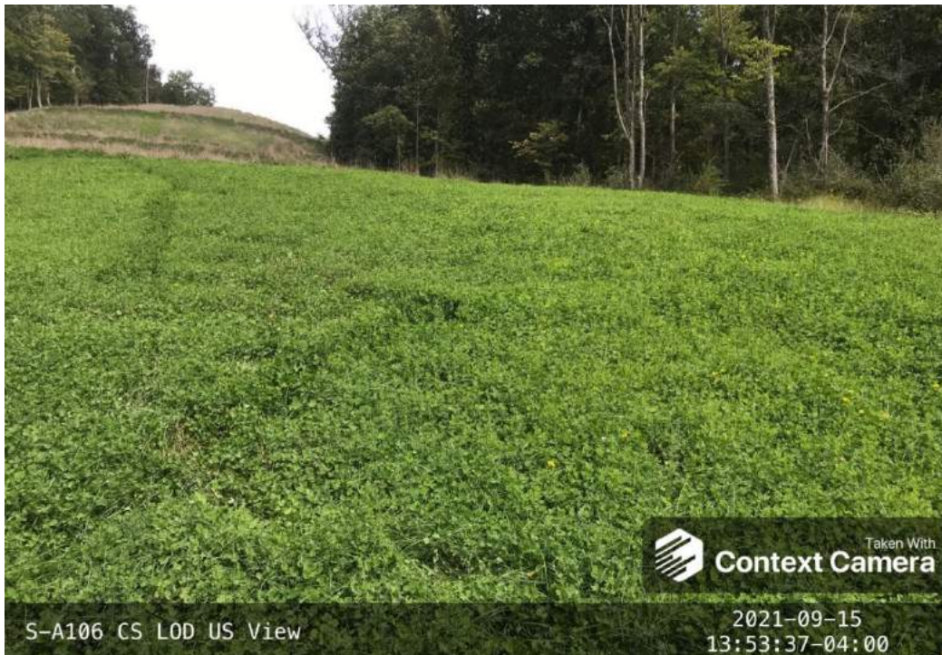
Photo Type: US View at Center Location, Orientation, Photographer Initials: Downstream Edge of ROW, Upstream View, Lat: 39.168435 Long: -80.577625