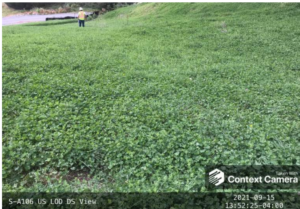
Photo Type: DS View at Center Location, Orientation, Photographer Initials: Downstream Edge of ROW, Upstream View, Lat: 39.168435 Long: -80.577625