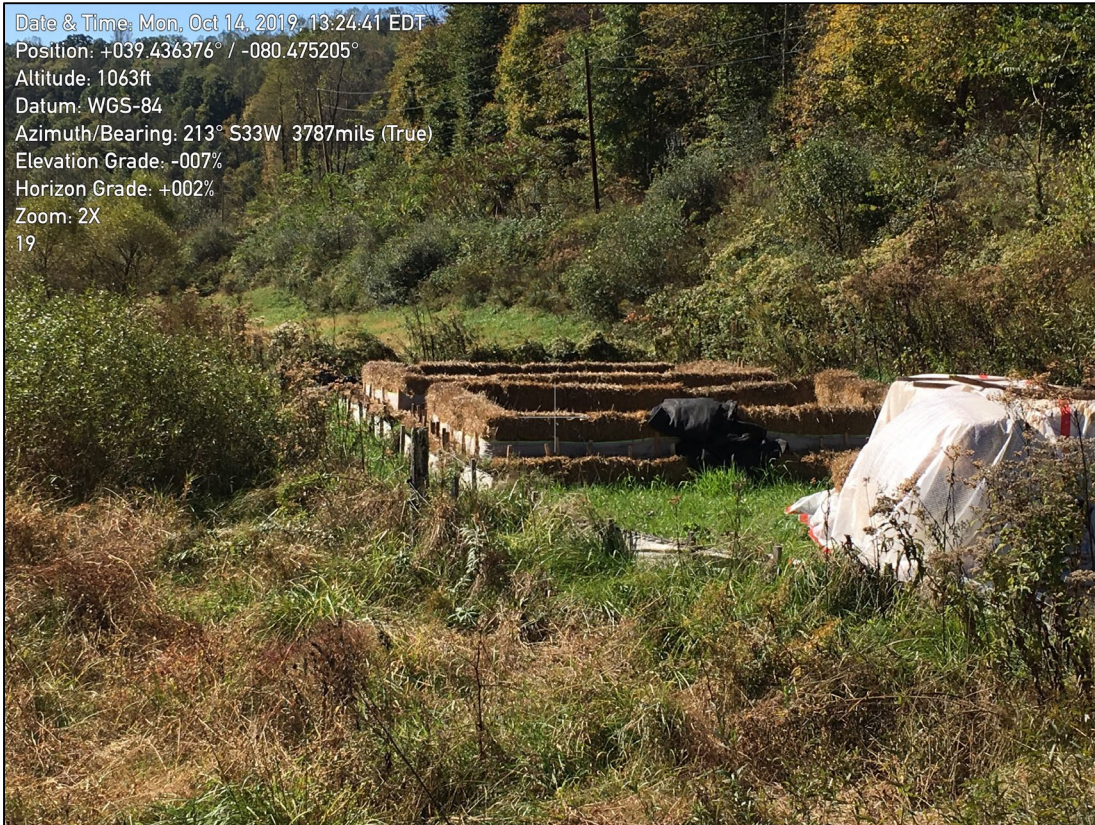
Photo 1: Photo illustrates the two additional dewatering structures that replaced the structure identified in the DEP investigation.