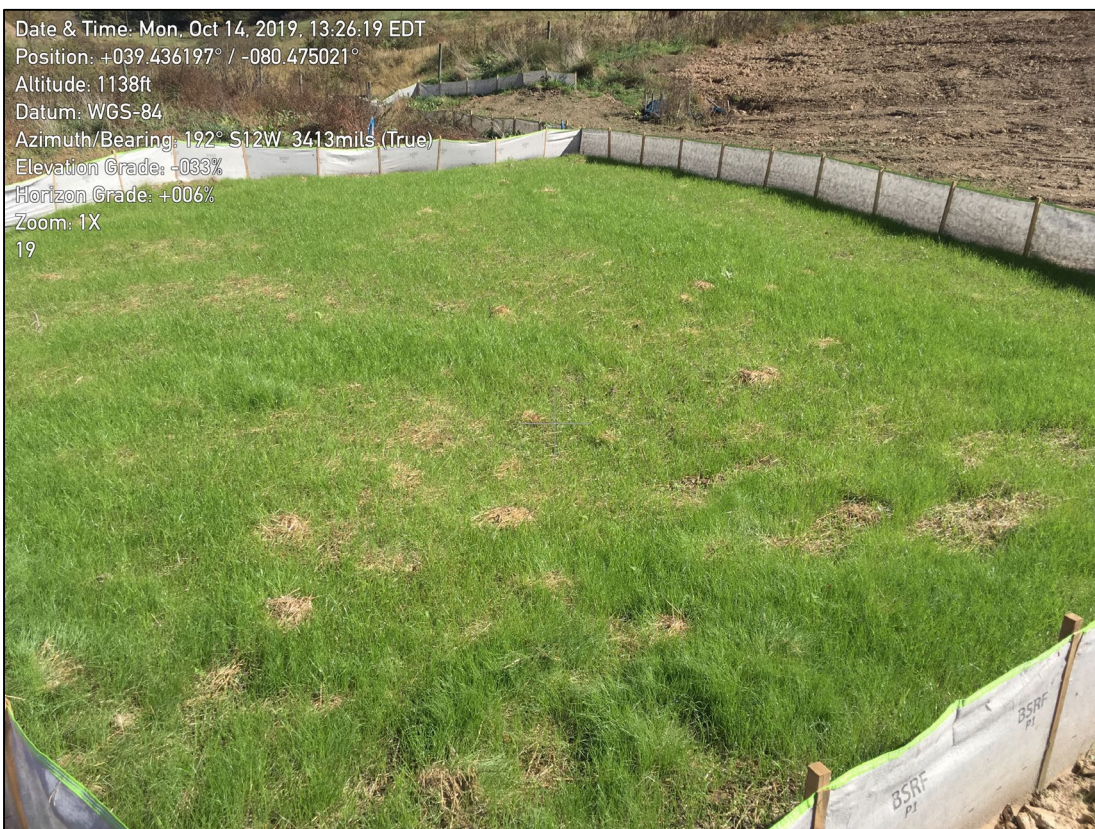
Photo 2: Photo illustrates the location of the original dewatering structure. The area is stabilized and vegetated.