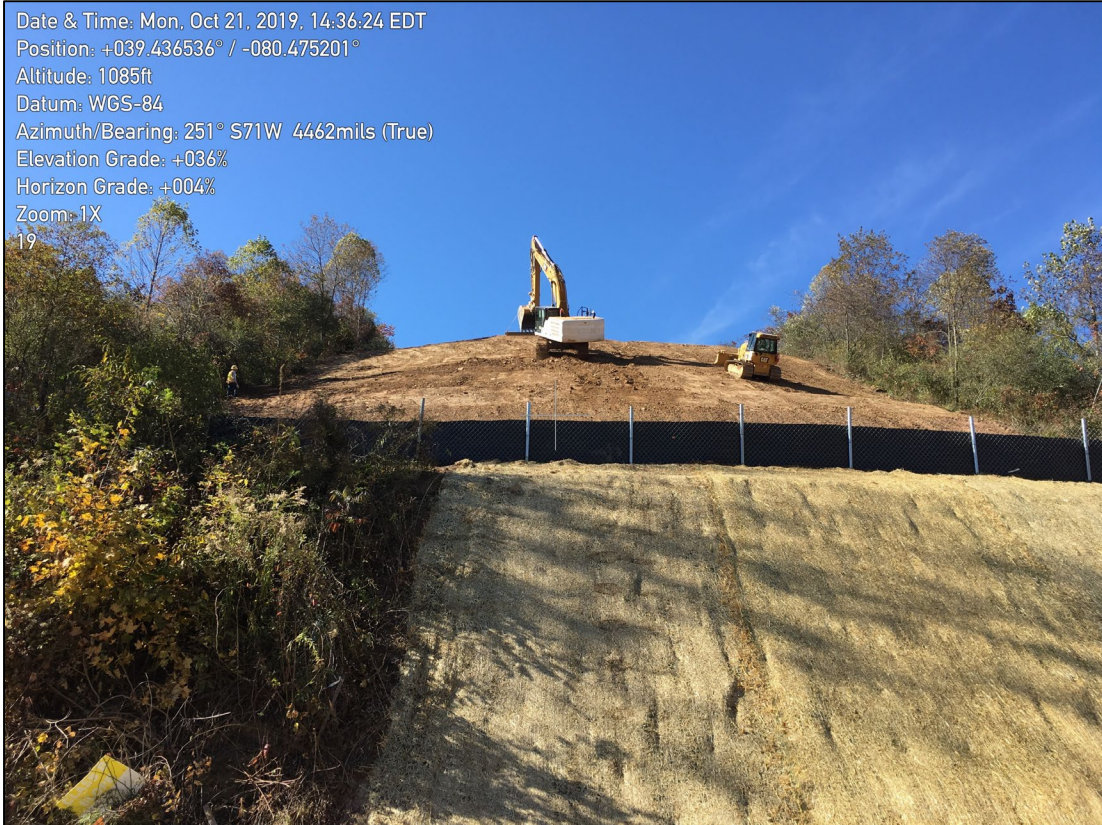
Photos 3 & 4: Photos illustrates the restoration near station 645+00. Erosion control blanketing and supersilt fence has been installed. The area upslope of the super silt fence is being prepared for restoration and stabilization.