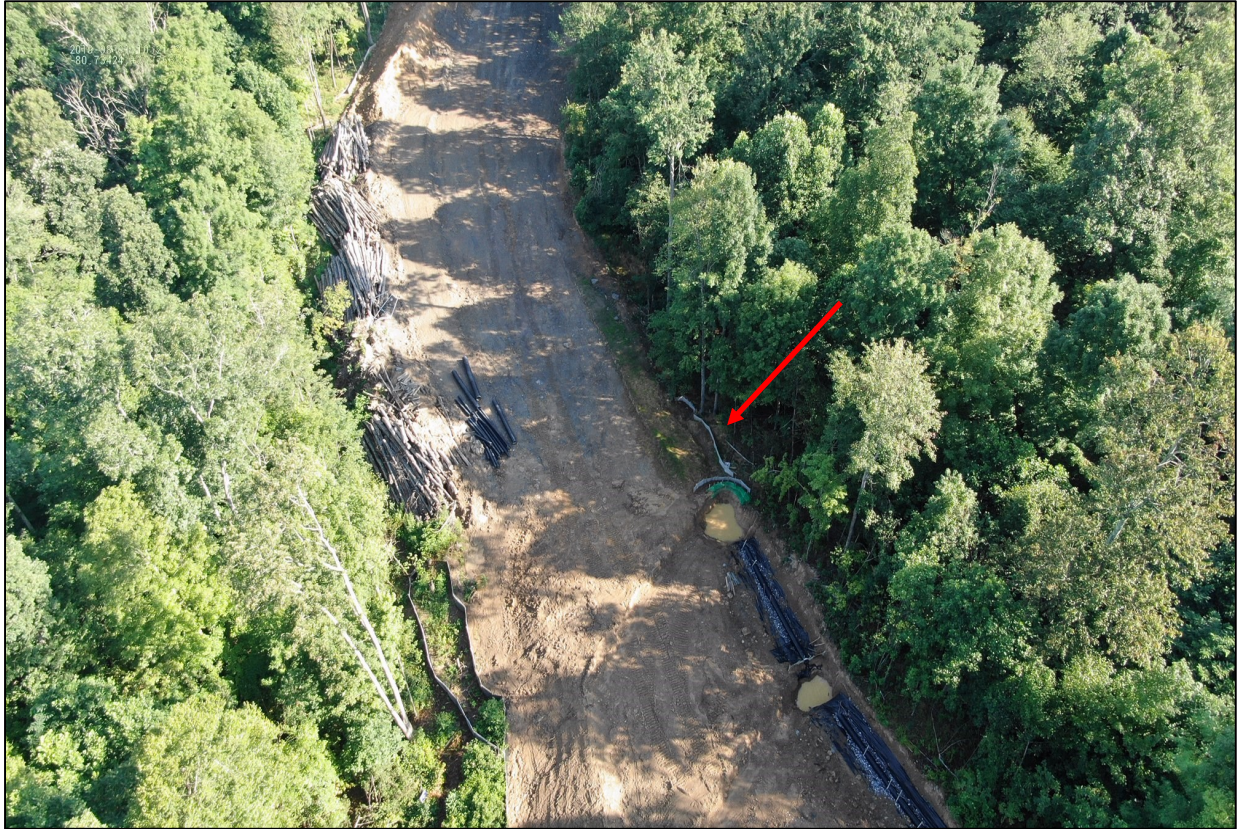
Photo 5: Photo illustrates the area where sediment was returned to the ROW.