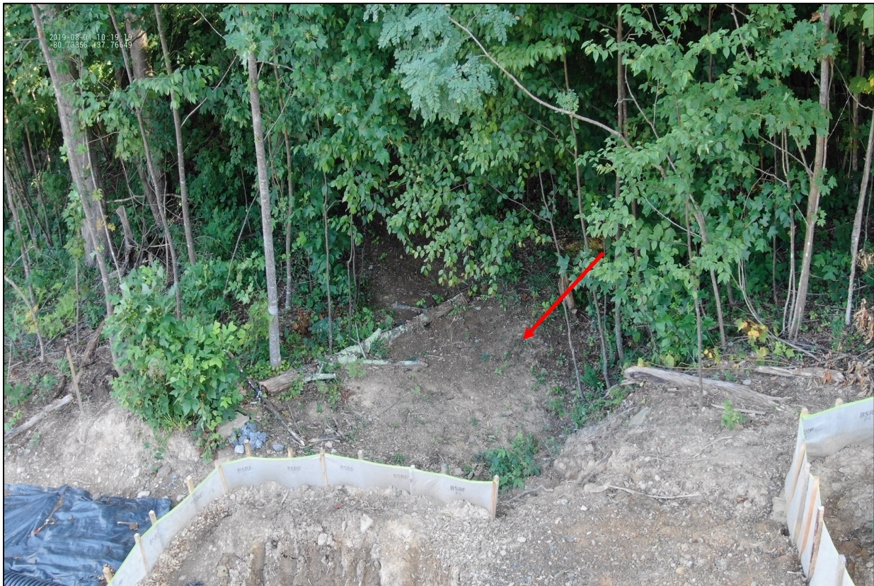
Photo 4: Photo illustrates the area where sediment has been returned the right-of-way (ROW).