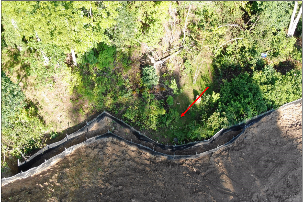
Photo 6: Photo illustrates the area where sediment was returned to the ROW and stabilized, near station 8634+00.