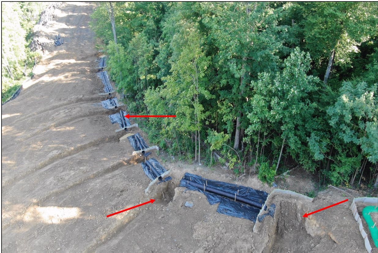
Photo 2: Photo illustrates the completed flume system and cleaned sumps in the inspection area.