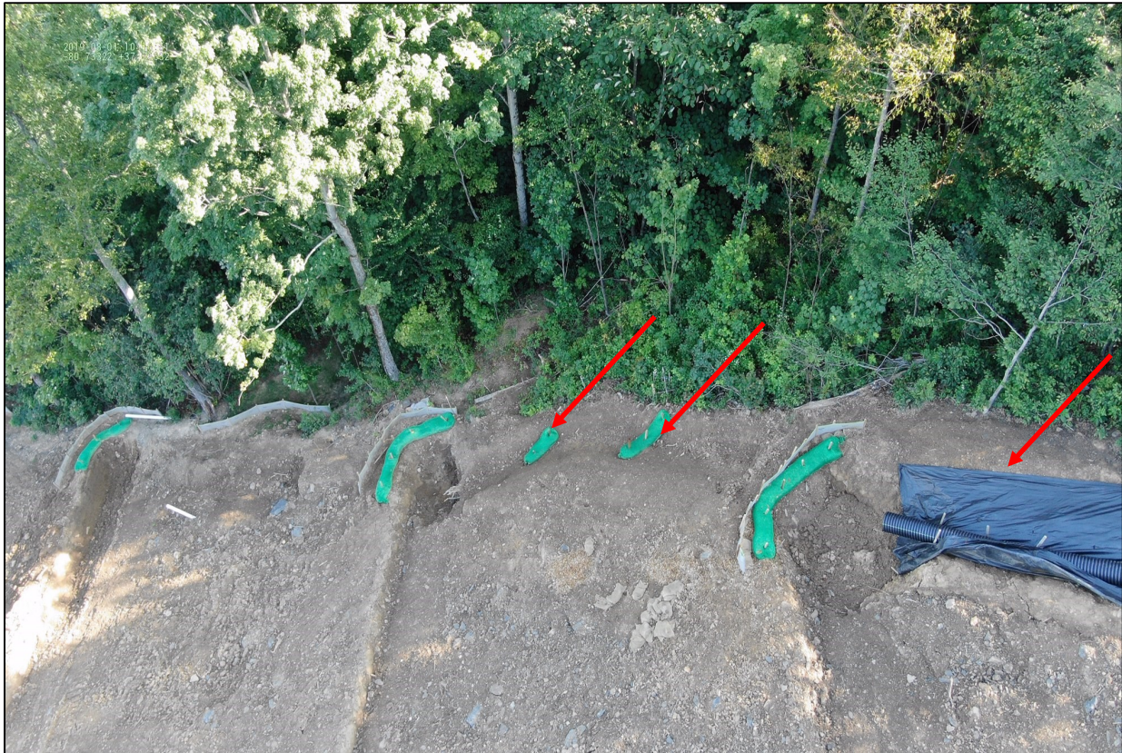
Photo 3: Photo illustrates additional rows of compost filter sock and the flume pipe system.