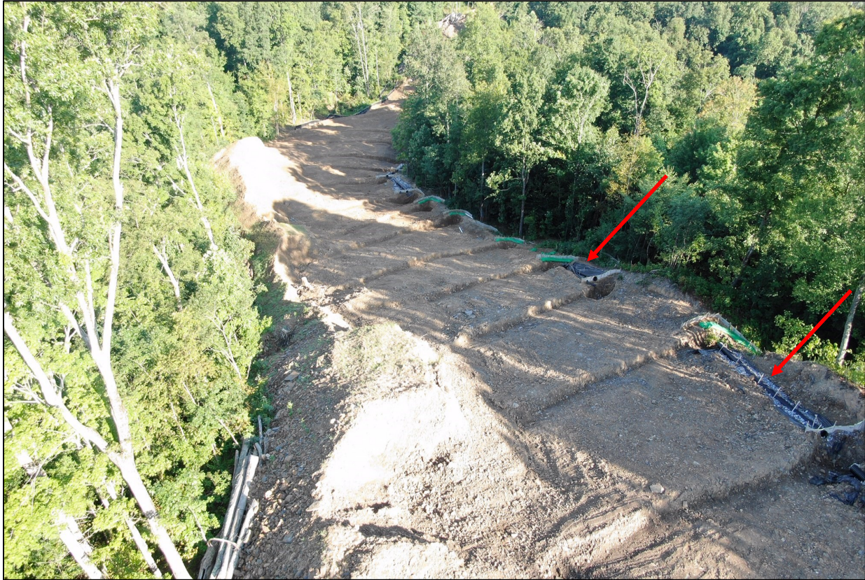
Photo 1: Photo illustrates the completed flume pipe system that has been installed.