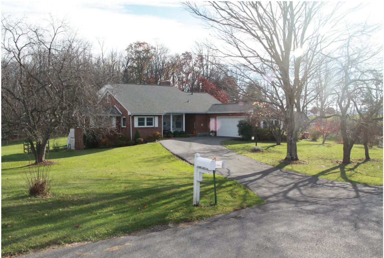
House (060-5181), 3842 Marla Drive, View Northwest