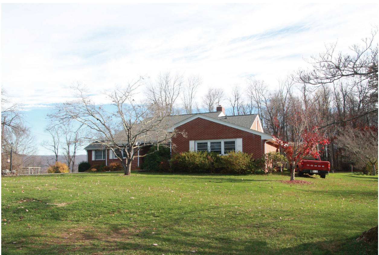
House (060-5181), 3842 Marla Drive, View Northeast