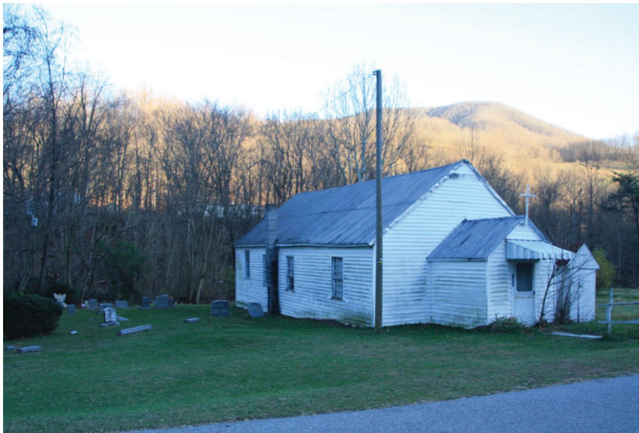
APG Lime Corp Plant #1 (035-5124), 2093 Big Stony Creek Road (Route 635), Church, View Southeast