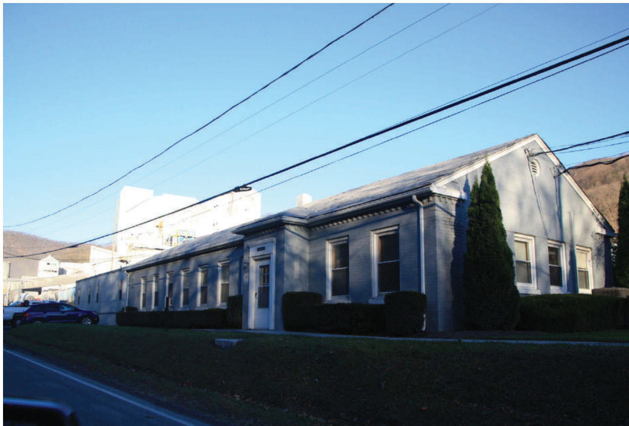
APG Lime Corp Plant #1 (035-5124), 2093 Big Stony Creek Road (Route 635), Office, View East