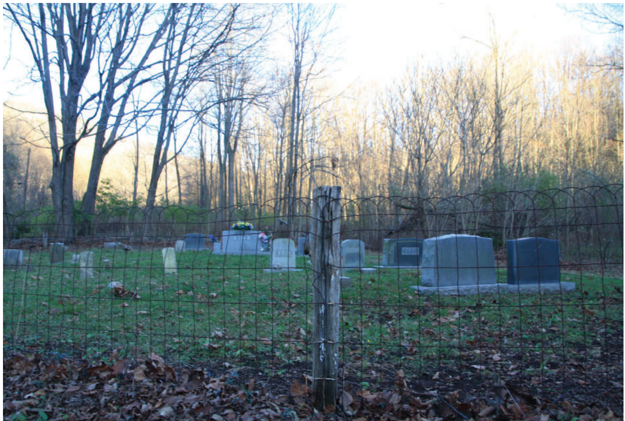
APG Lime Corp Plant #1 (035-5124), 2093 Big Stony Creek Road (Route 635), Reed Cemetery, View East