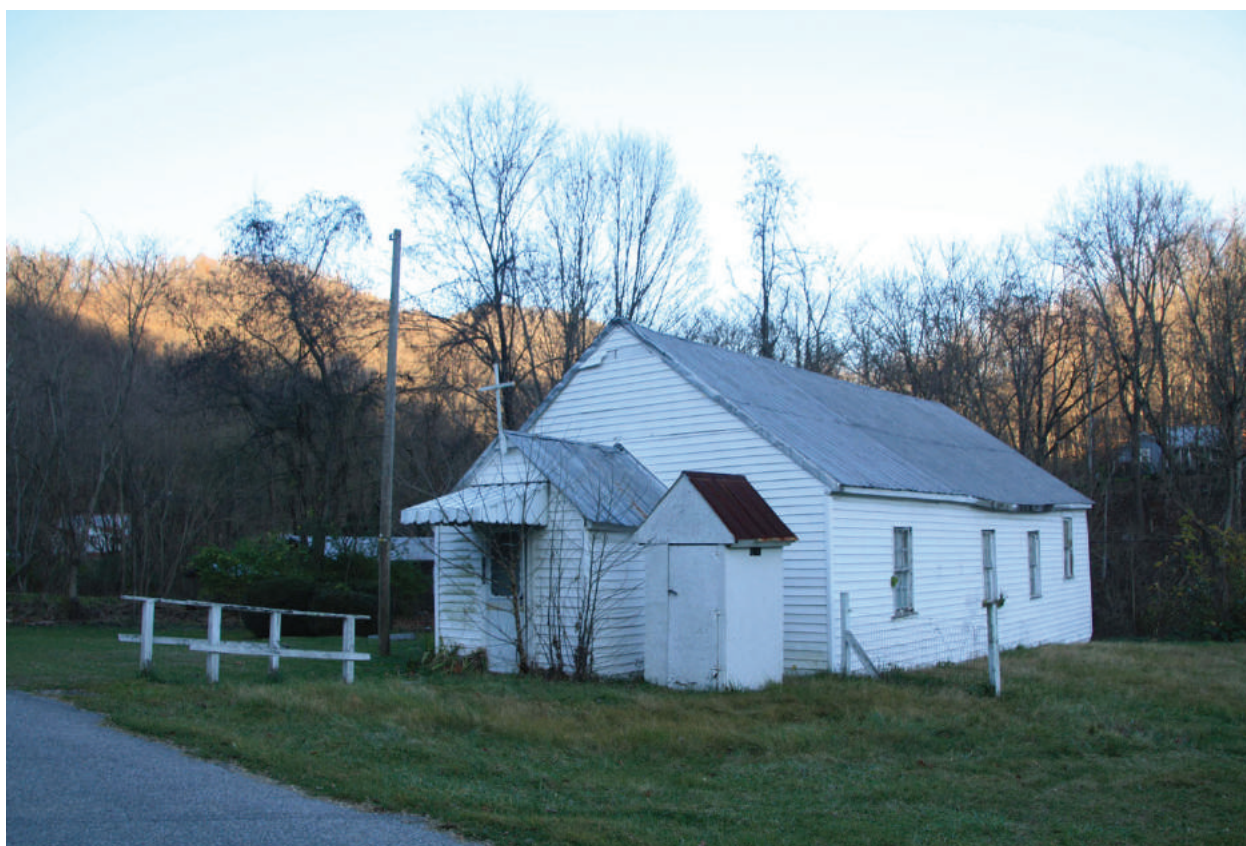
APG Lime Corp Plant #1 (035-5124), 2093 Big Stony Creek Road (Route 635), Church, View Northeast