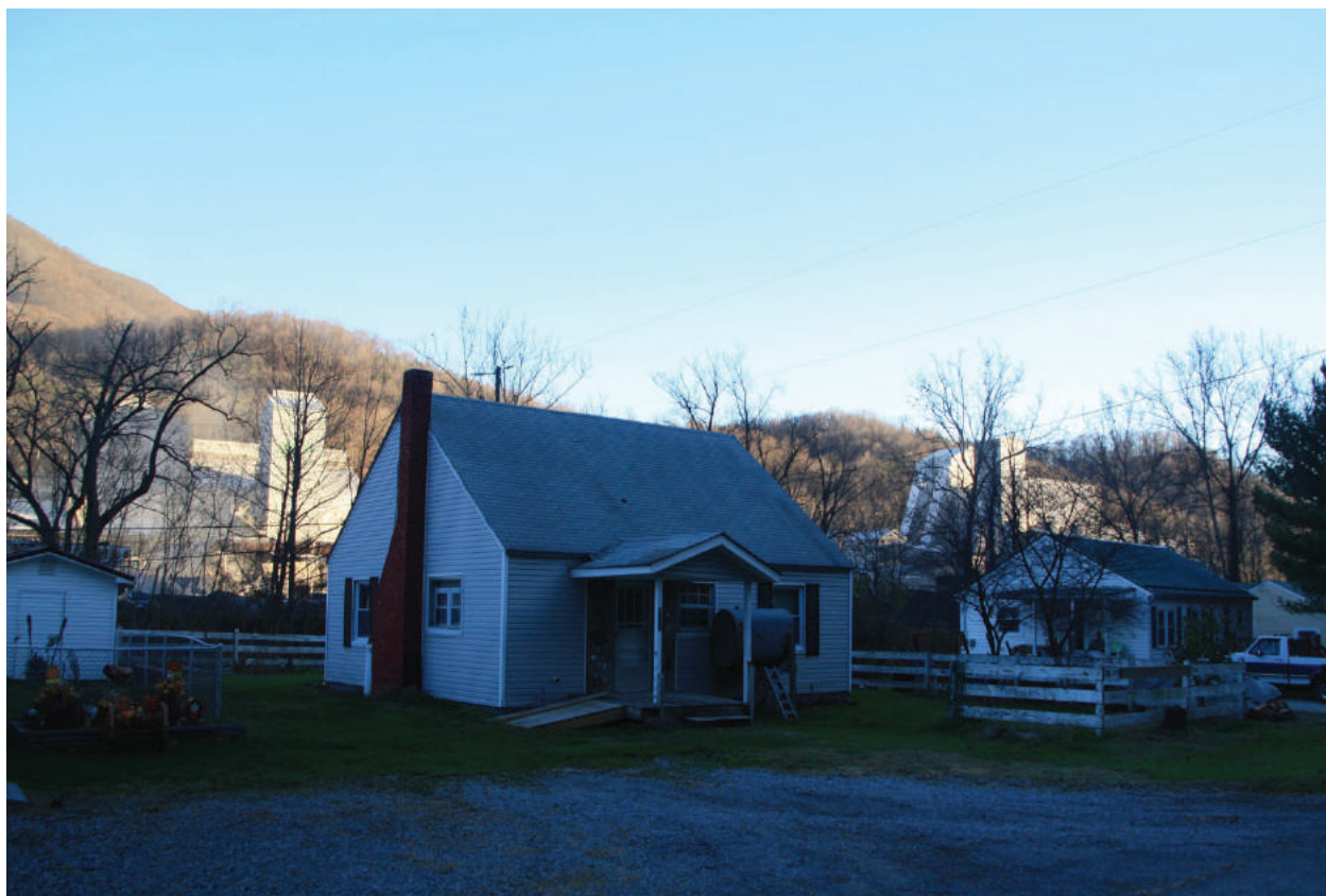
APG Lime Corp Plant #1 (035-5124), 2093 Big Stony Creek Road (Route 635), House 4, View Southeast