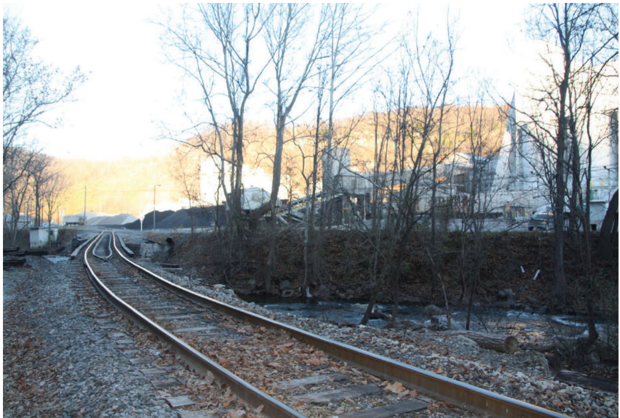
Big Stony Railway (035-5126), From Big Stony Junction on the New River to APG Lime Corp Lime #1, at Lime Corp Plant # 2 (035-5124), View Northeast