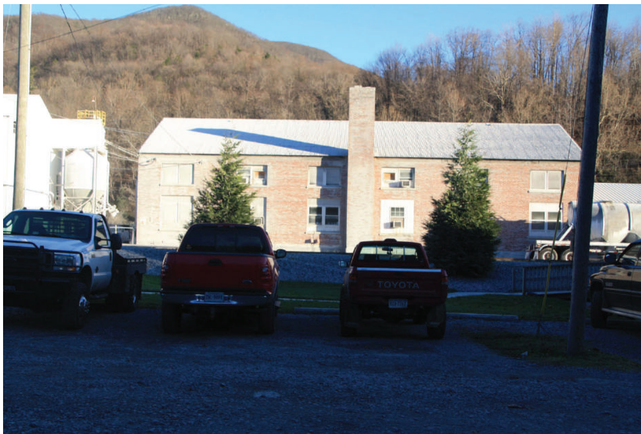
APG Lime Corp Plant #1 (035-5124), 2093 Big Stony Creek Road (Route 635), Offices, View Southeast