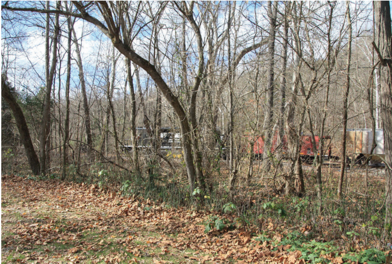
Big Stony Railway (035-5126), From Big Stony Junction on the New River to APG Lime Corp Lime #1, at Big Stony United Methodist Church (035-5119), View North