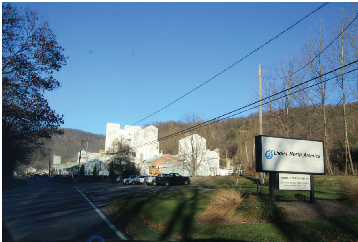
APG Lime Corp Plant #1 (035-5124), 2093 Big Stony Creek Road (Route 635), Setting, View North-Northeast