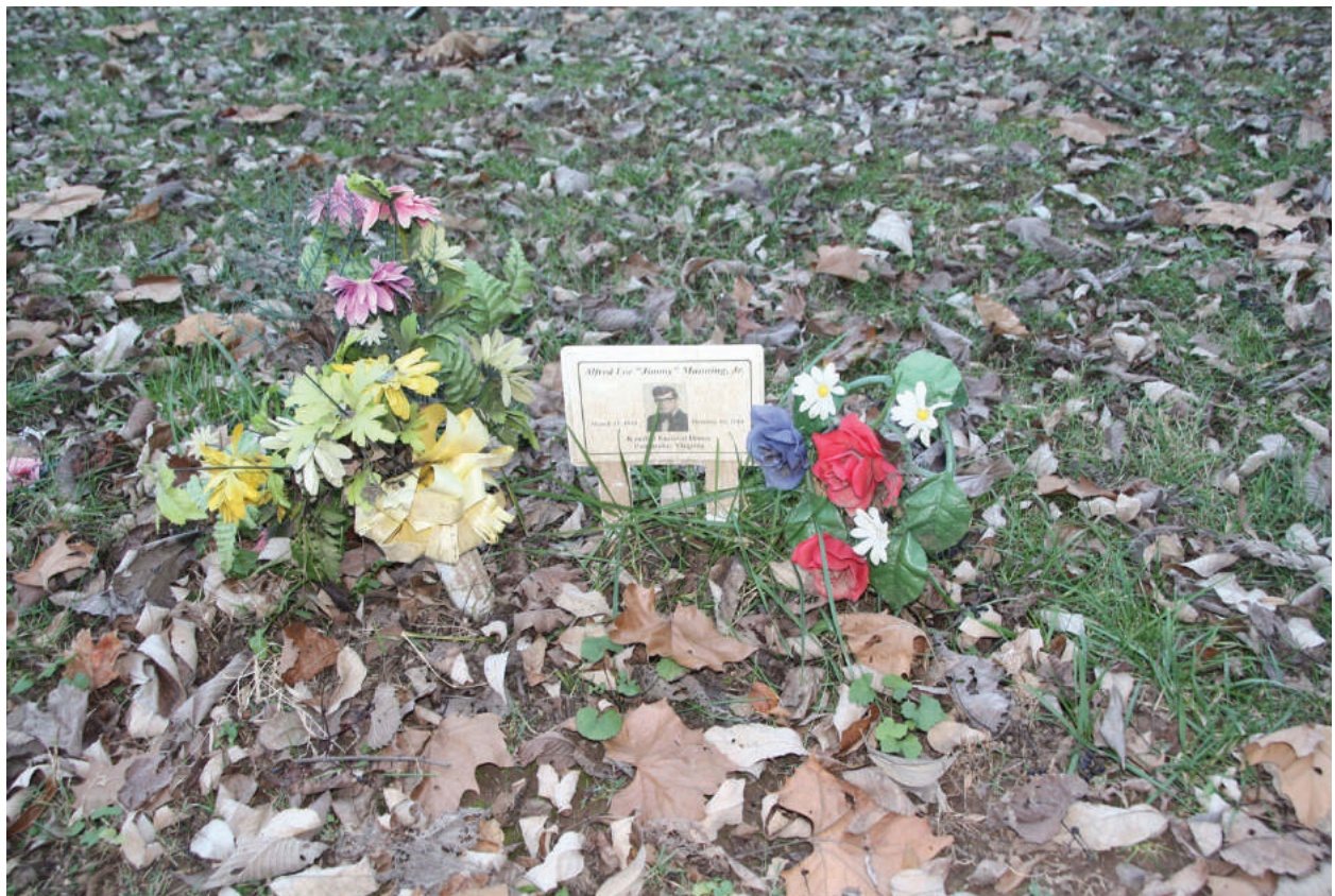
APG Lime Corp Plant #1 (035-5124), 2093 Big Stony Creek Road (Route 635), Lucas Family Cemetery Marker 1, View South