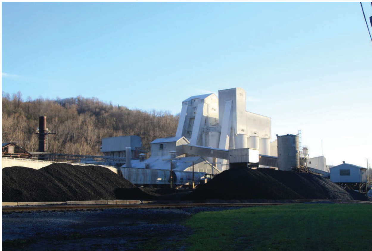
APG Lime Corp Plant #1 (035-5124), 2093 Big Stony Creek Road (Route 635), Crushers, View Southeast