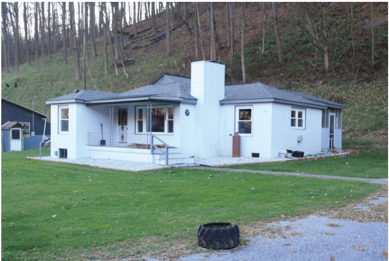
APG Lime Corp Plant #1 (035-5124), 2093 Big Stony Creek Road (Route 635), House 1, View Southwest