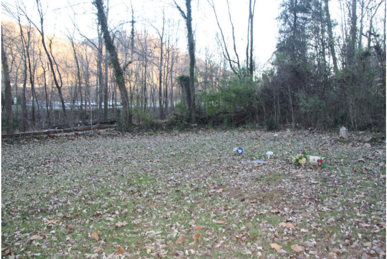
APG Lime Corp Plant #1 (035-5124), 2093 Big Stony Creek Road (Route 635), Lucas Family Cemetery, View Southeast