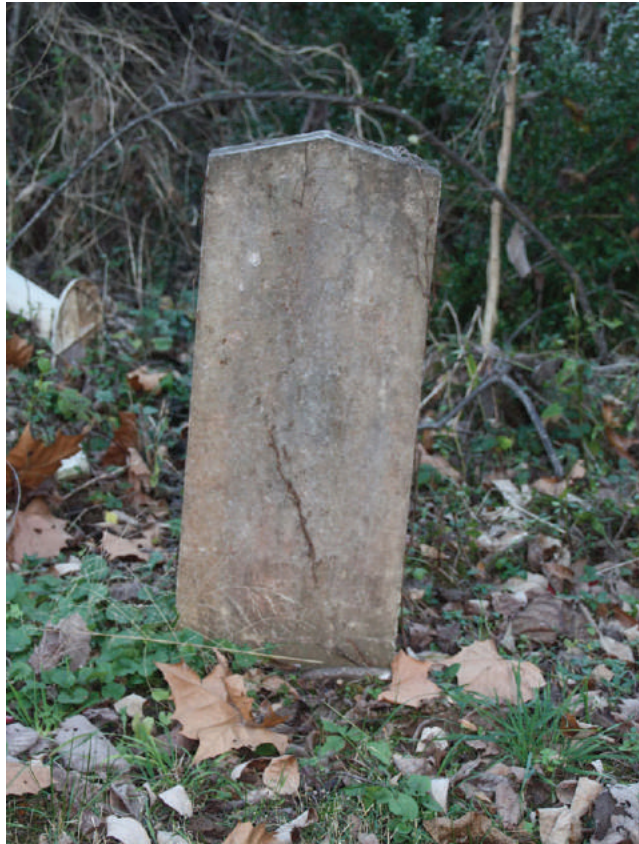
APG Lime Corp Plant #1 (035-5124), 2093 Big Stony Creek Road (Route 635), Lucas Family Cemetery Marker 2, View South