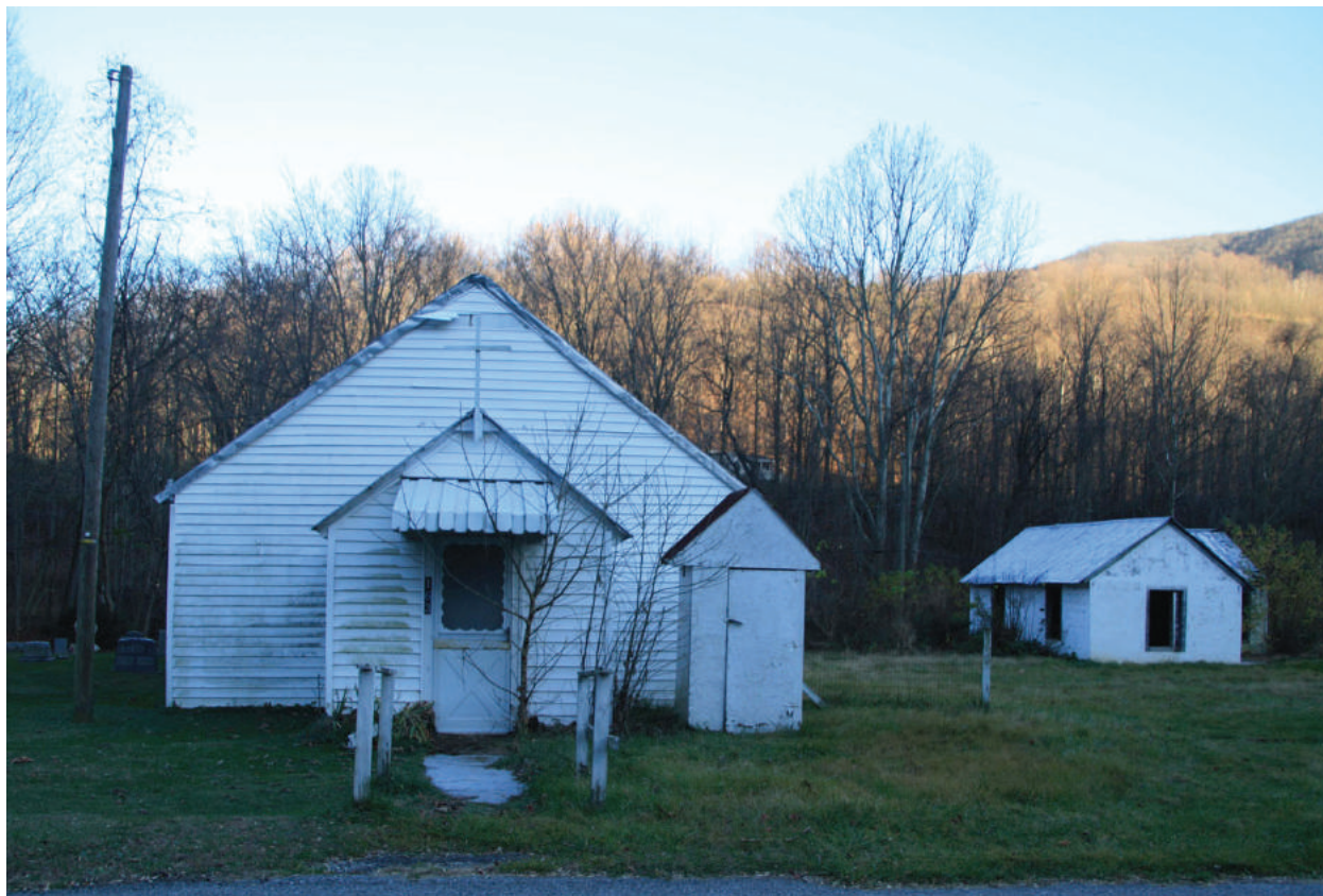
APG Lime Corp Plant #1 (035-5124), 2093 Big Stony Creek Road (Route 635), Church, View East