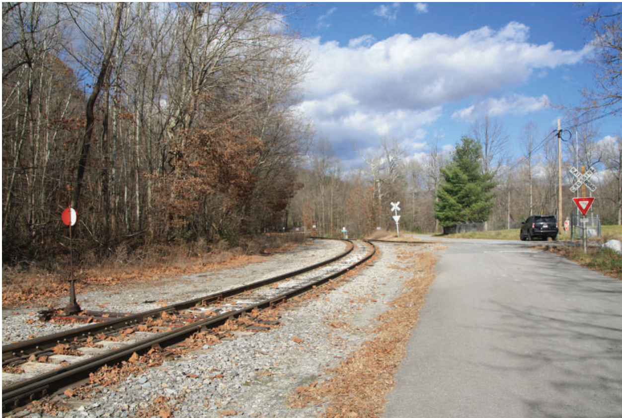
Big Stony Railway (035-5126), From Big Stony Junction on the New River to APG Lime Corp Lime #1, at Lime Corp Plant #2 (035-5120), View North