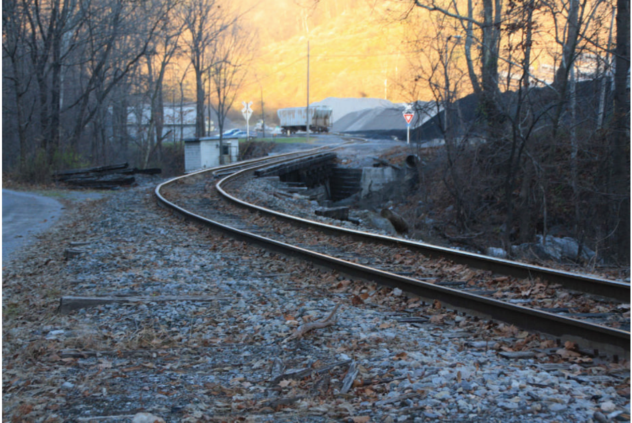
APG Lime Corp Plant #1 (035-5124), 2093 Big Stony Creek Road (Route 635), Railroad Crossing, View Northeast