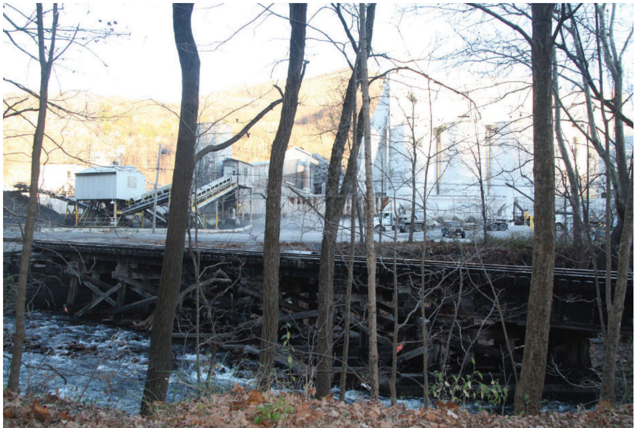
APG Lime Corp Plant #1 (035-5124), 2093 Big Stony Creek Road (Route 635), Railroad Crossing, View East-Northeast