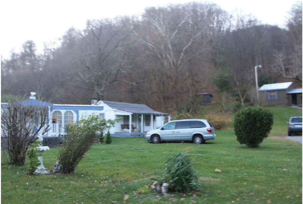
APG Lime Corp Plant #1 (035-5124), 2093 Big Stony Creek Road (Route 635), House 1, View West-Southwest