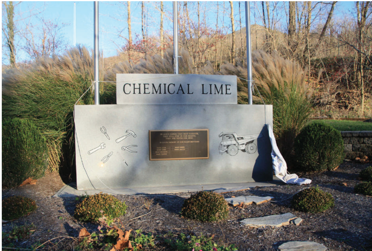
APG Lime Corp Plant #1 (035-5124), 2093 Big Stony Creek Road (Route 635), Memorial, View East