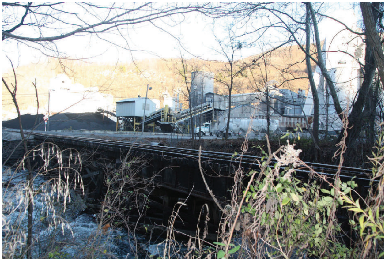
APG Lime Corp Plant #1 (035-5124), 2093 Big Stony Creek Road (Route 635), Railroad Crossing, View Northeast