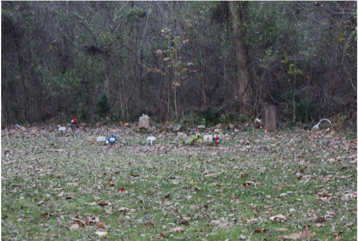
APG Lime Corp Plant #1 (035-5124), 2093 Big Stony Creek Road (Route 635), Lucas Family Cemetery, View South