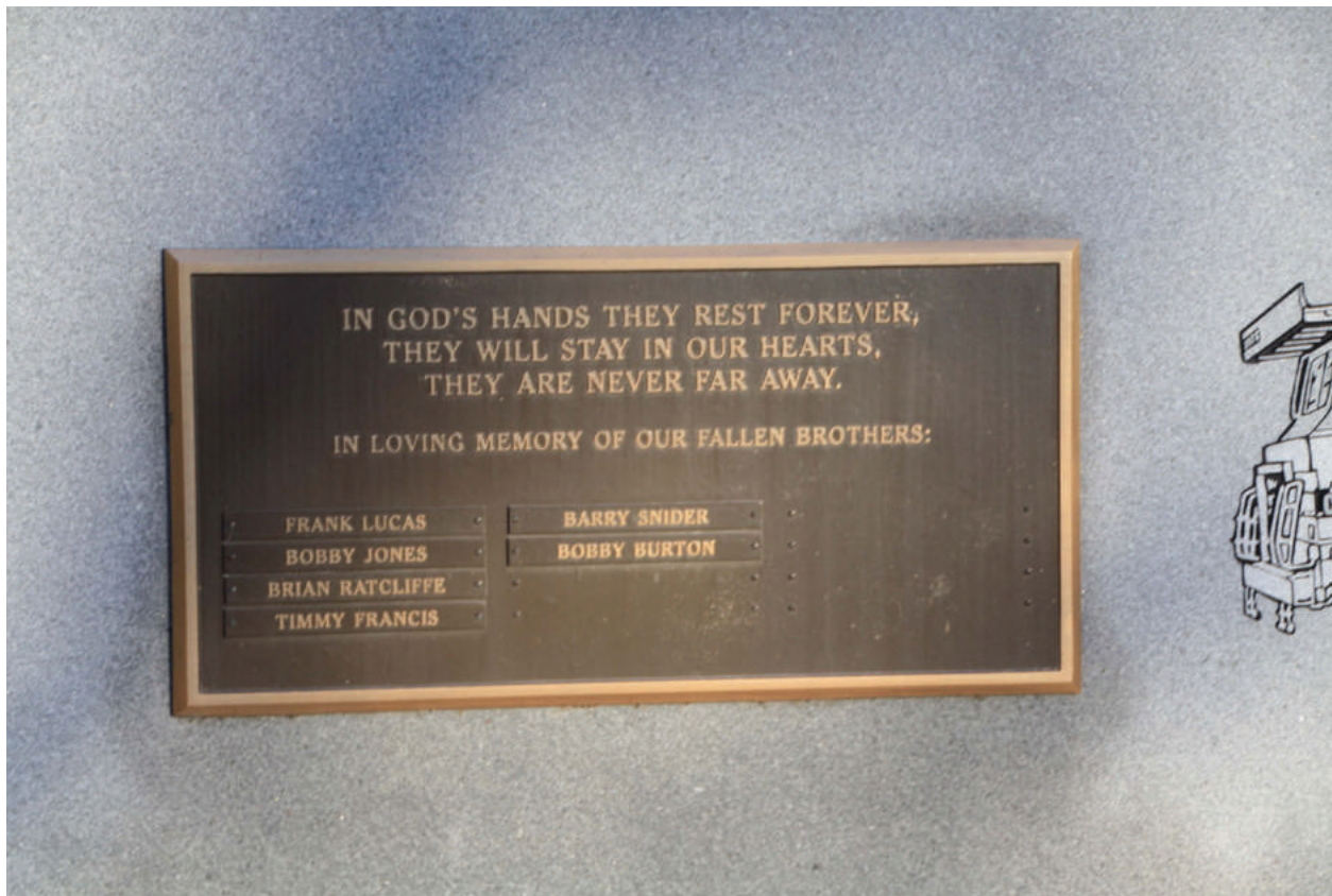
APG Lime Corp Plant #1 (035-5124), 2093 Big Stony Creek Road (Route 635), Memorial, Close-up