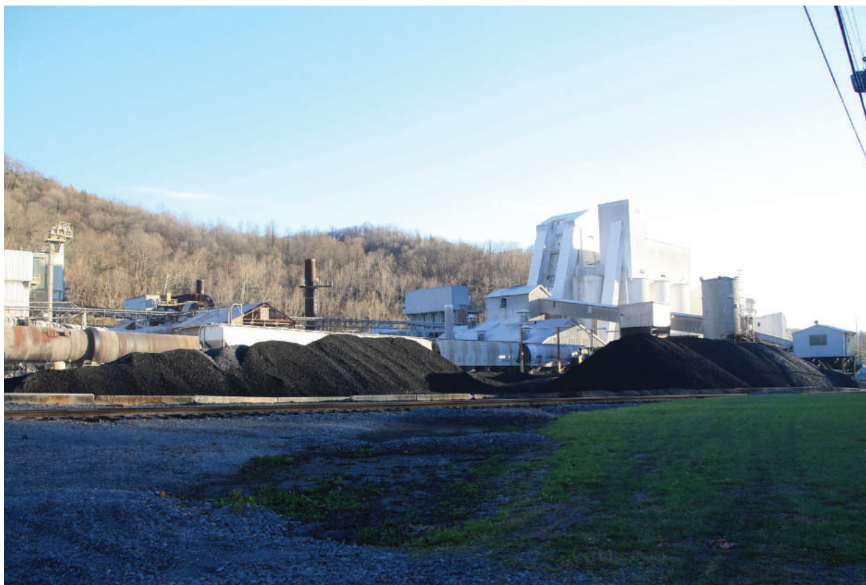
APG Lime Corp Plant #1 (035-5124), 2093 Big Stony Creek Road (Route 635), Crushers, View Southeast