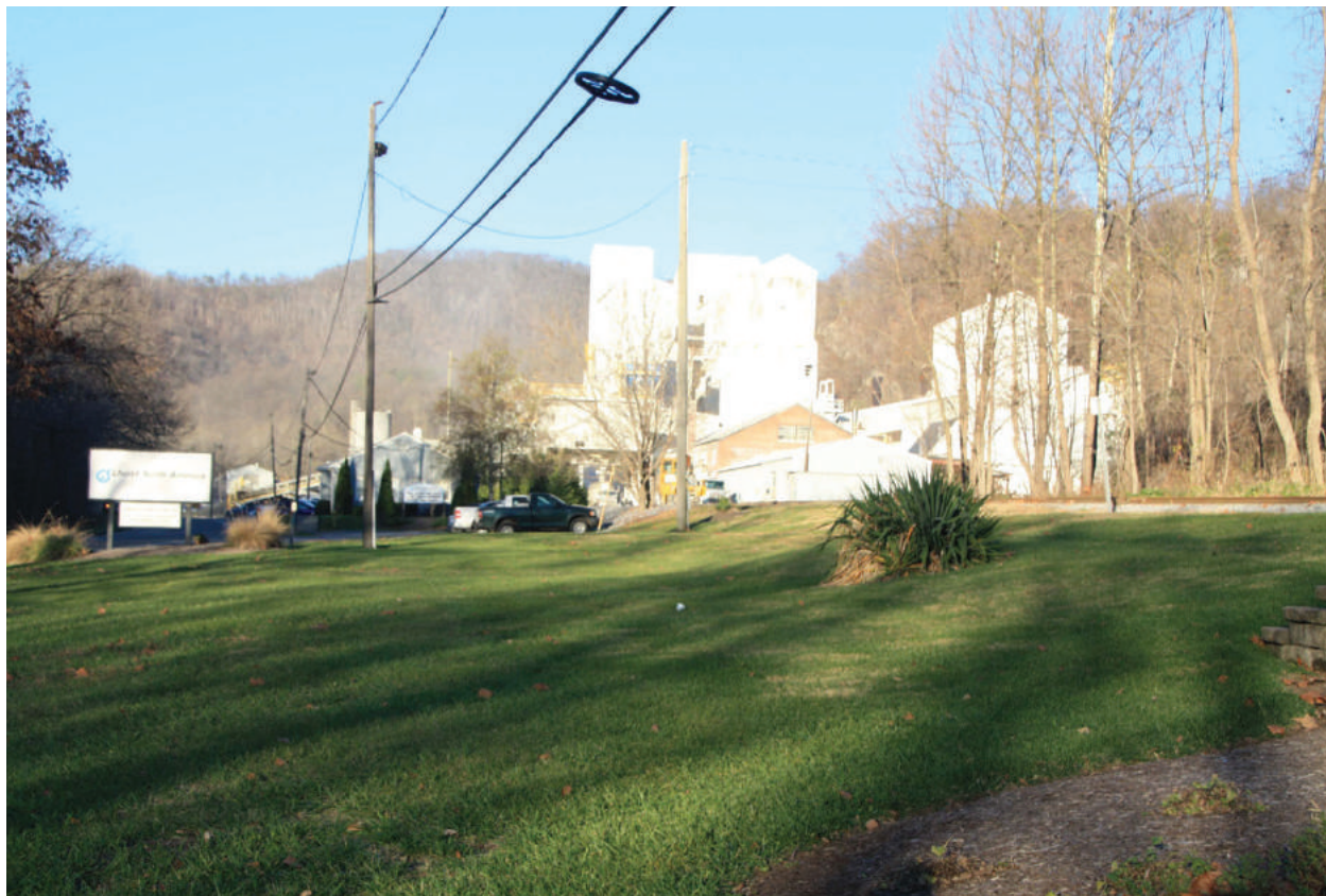
APG Lime Corp Plant #1 (035-5124), 2093 Big Stony Creek Road (Route 635), Setting, View Northeast