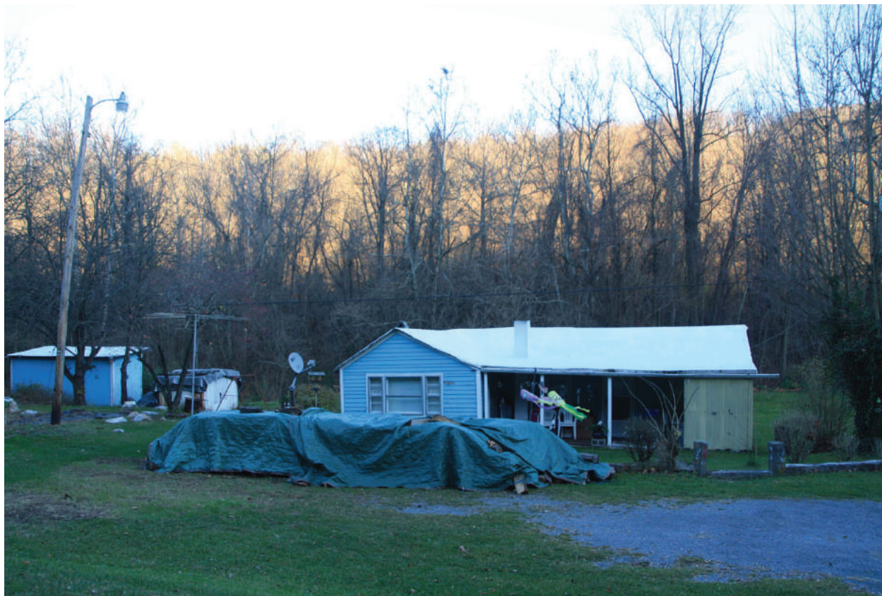
APG Lime Corp Plant #1 (035-5124), 2093 Big Stony Creek Road (Route 635), House 3, View East-Southeast