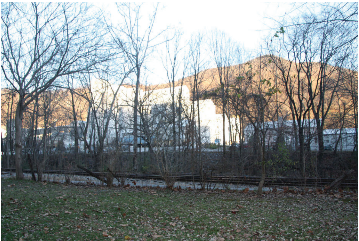
APG Lime Corp Plant #1 (035-5124), 2093 Big Stony Creek Road (Route 635), Lucas Family Cemetery, View East