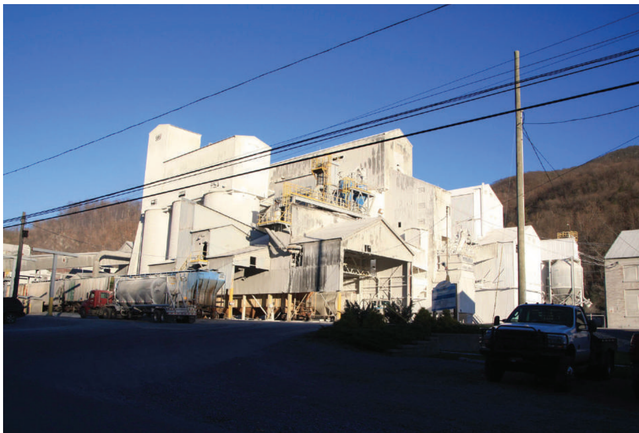
APG Lime Corp Plant #1 (035-5124), 2093 Big Stony Creek Road (Route 635), Crushers, View Northeast