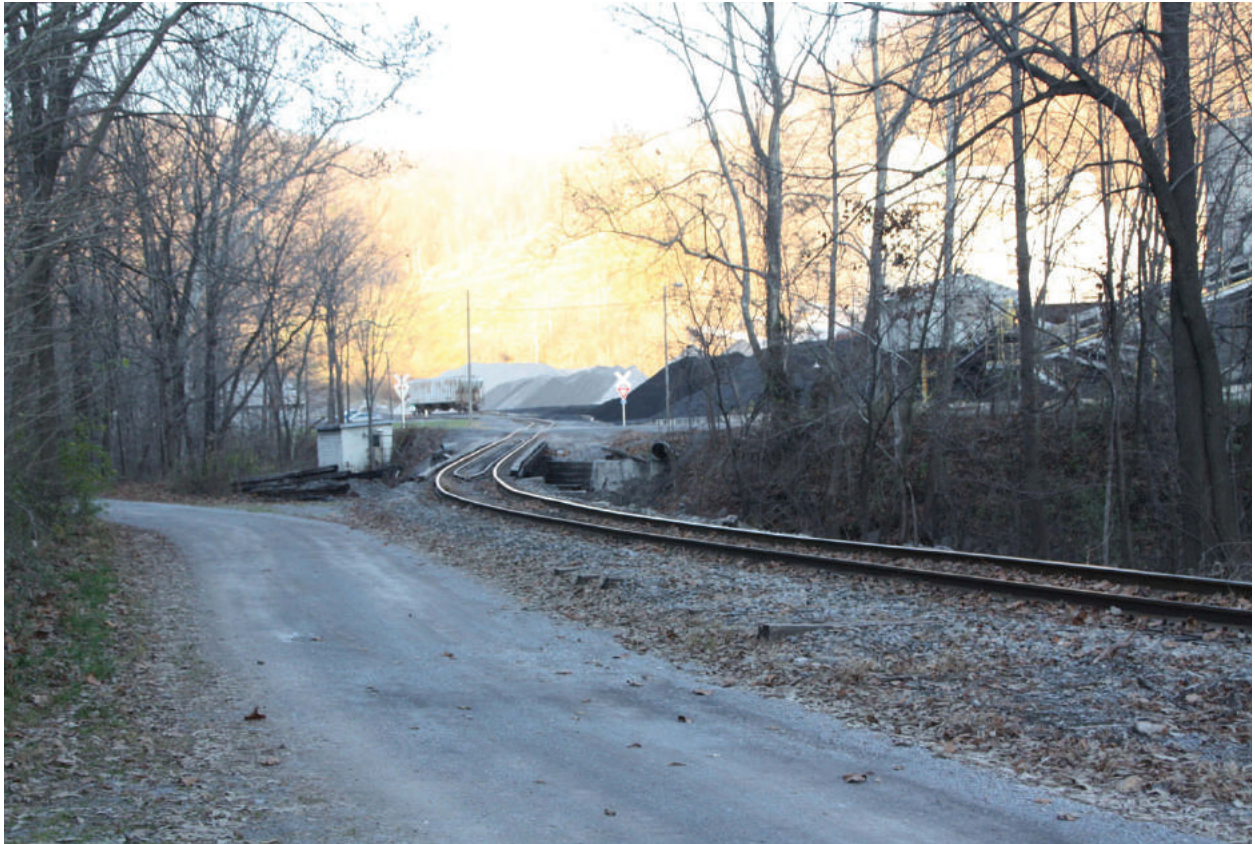
APG Lime Corp Plant #1 (035-5124), 2093 Big Stony Creek Road (Route 635), Railroad Crossing, View Northeast