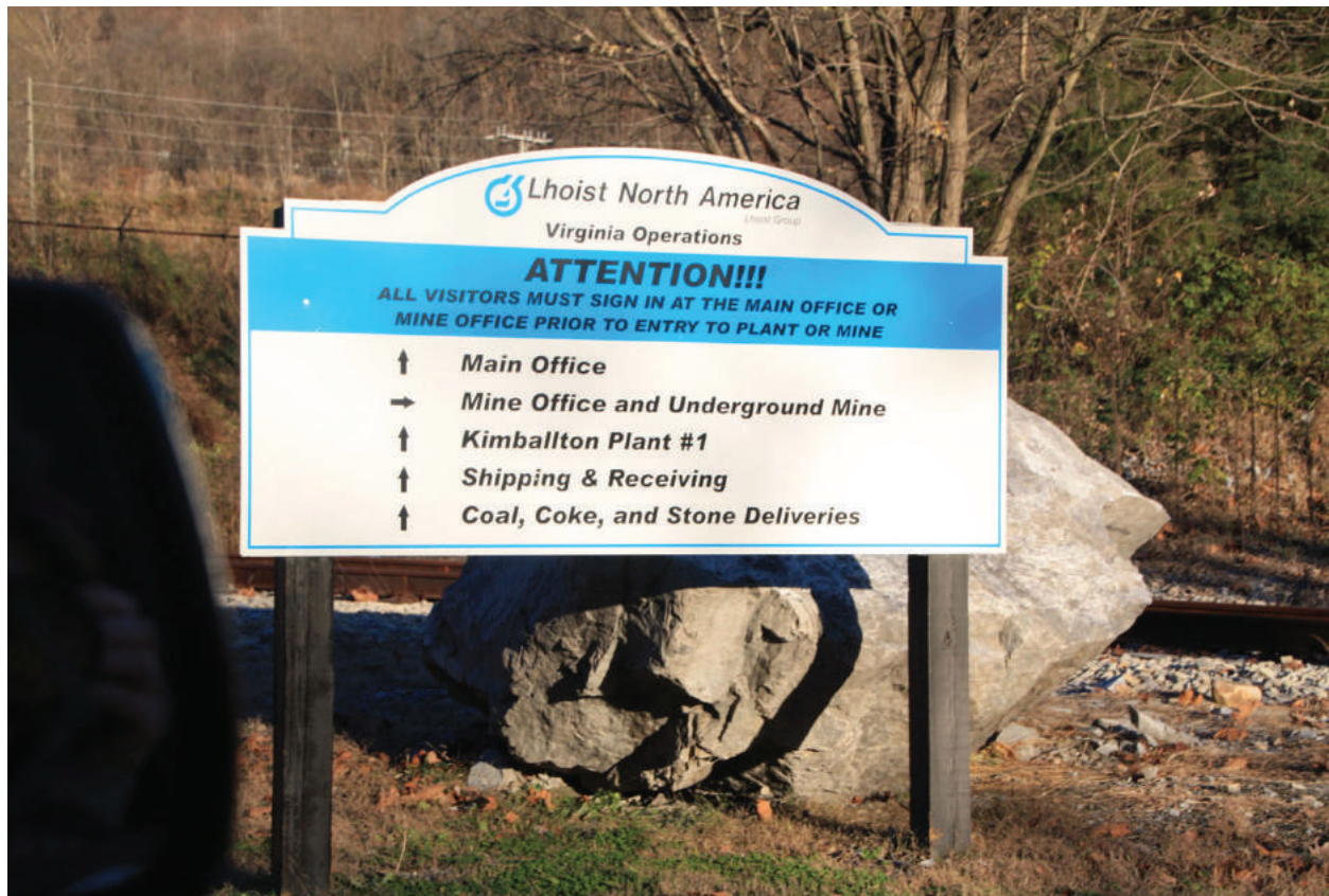
APG Lime Corp Plant #1 (035-5124), 2093 Big Stony Creek Road (Route 635), Sign, View Northeast